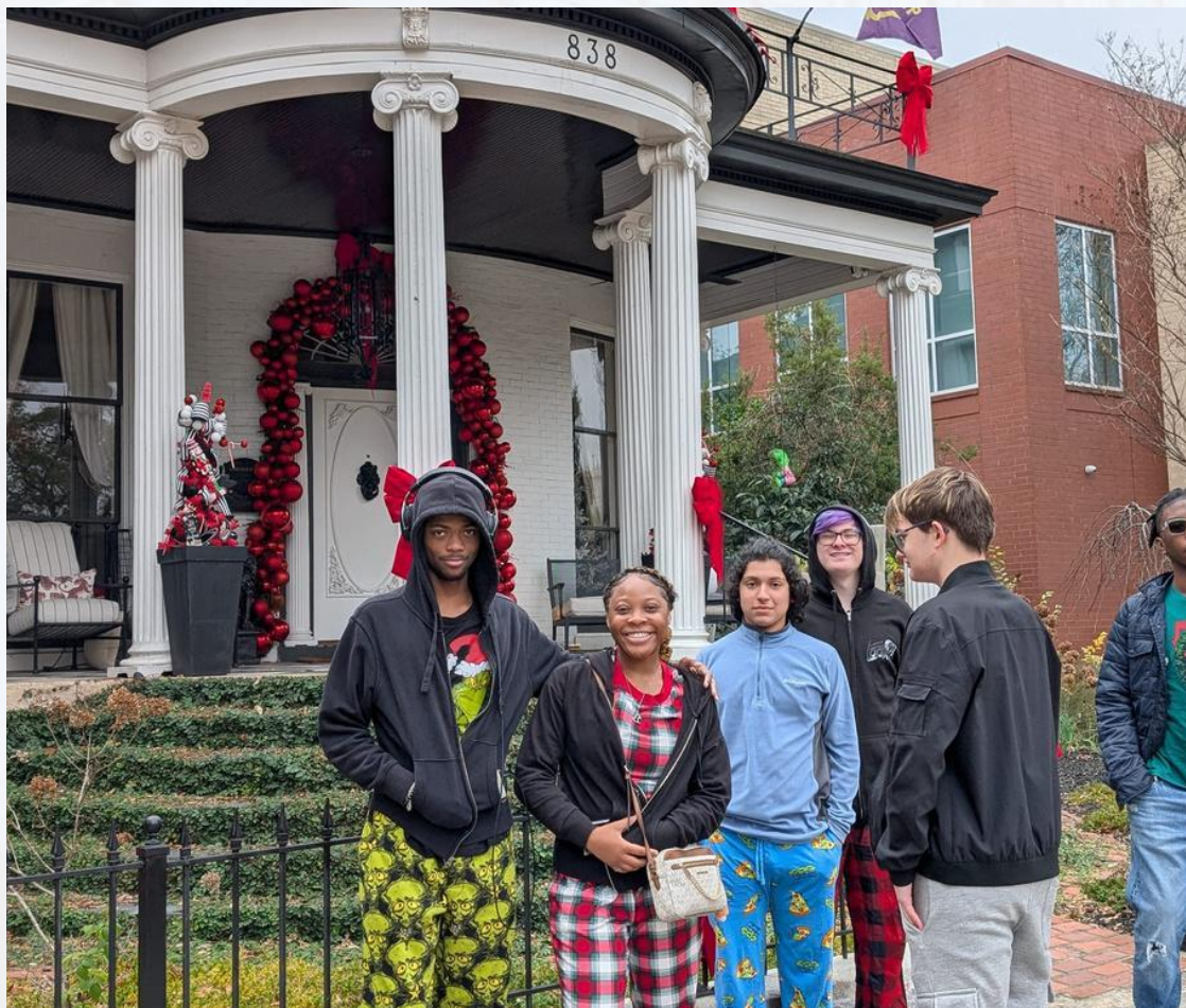
Location: Downtown, Augusta, Georgia